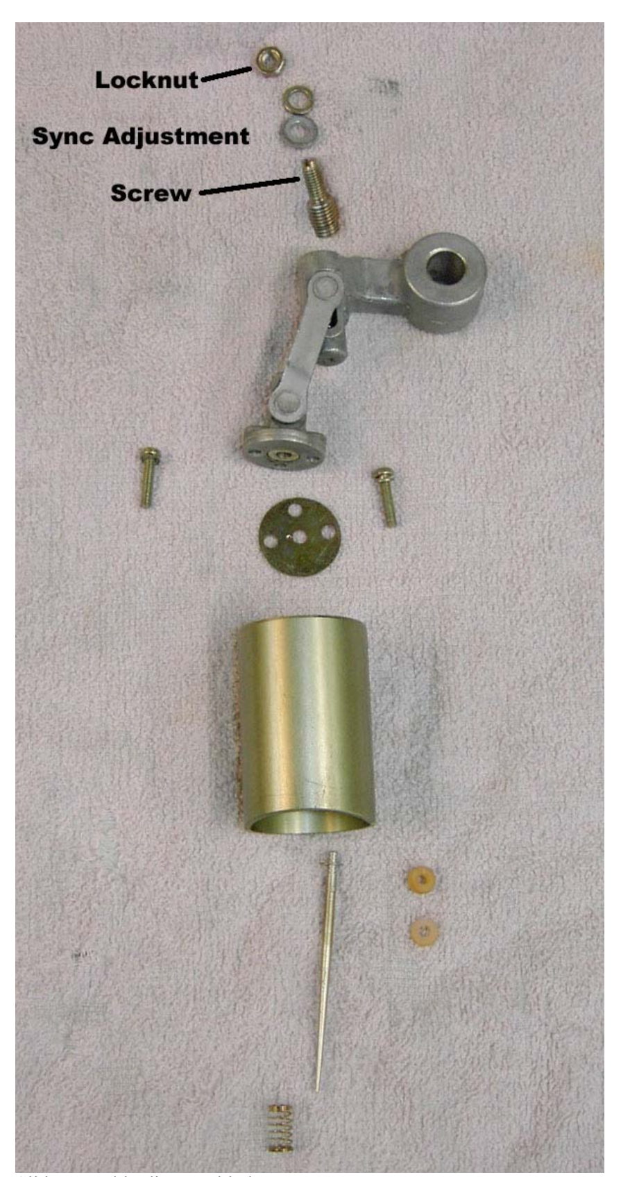
Slide assembly disassembled