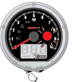
1. Shift light value setting