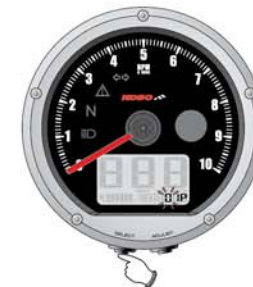
4. Sensing point