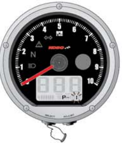
5. Piston numbers