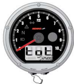
10. Internal ODO display