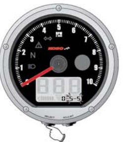
9. Backlight brightness