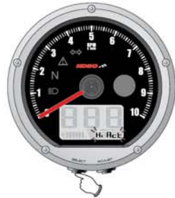
6. Signal type