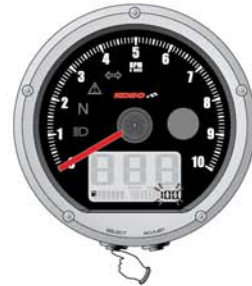
7. Fuel gauge resistance