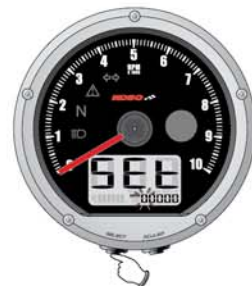
11. External ODO setting

⚠ The screen will return to the main screen after 30 seconds if no button is press.