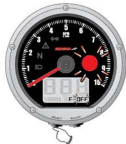
2. Shift light flashing ON/OFF