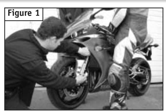
To measure front suspension sag, the front suspension must first be extended fully by having two people lift the front end off the ground.

If all the available preload is added and the resulting sag is still greater than