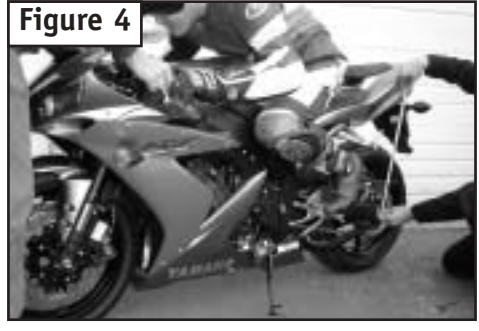
The second measurement of rear suspension sag must be made with the rider on the bike.

38mm, then the fork springs are too soft and should be replaced. Or, if all the preload is removed and the correct sag cannot be reached, the fork springs are too stiff and should be replaced.