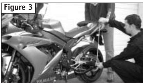
Rear suspension sag is measured in almost the same way as front suspension sag, except to extend the suspension the rear wheel does not have to be lifted off