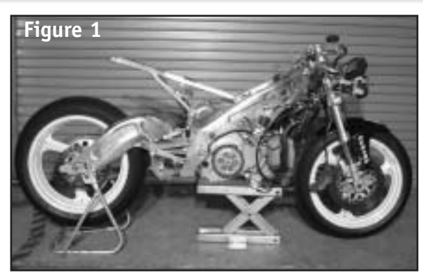
Once the forks are loosened/removed, the bike will want to fall forward so make sure it is solidly supported before you start.

Should you be inspecting an older vintage bike that has loose ball bearings held in place by grease, have several friends and lots of magnets ready. If the bearings are dry they scatter like marbles. I have played 'catch' for my dad several times over the years. It is not quite as much fun putting