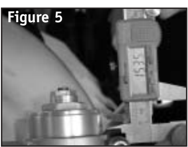
Digital Vernier calipers are used to measure how far the fork tube protrudes above the upper triple clamp.

them back in, but entertaining all the same.