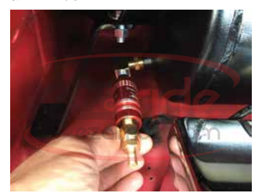
Simply, push the assembled schrader valve into the quick connect.

25' Coil Hose, Quick Connect, Brass Tee, Female Coupler, Schrader Valve, & Air Chuck