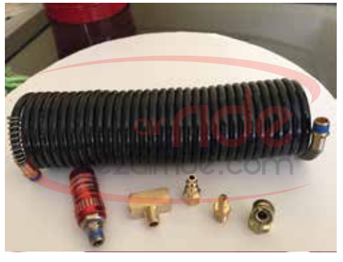
Your new EZ Air Ride™ suspension kit comes with our complimentary Spare Air™ system.

25' Coil Hose, Quick Connect, Brass Tee, Female Coupler, Schrader Valve, & Air Chuck