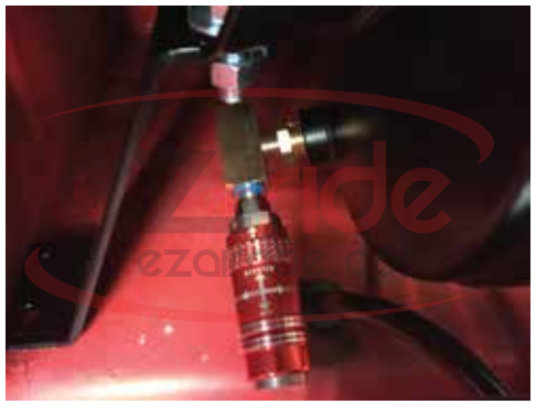
Connect the brass Tee to the side of the tank. Pressure switch (not shown) plugs into the back side and the quick connect plugs into the front.