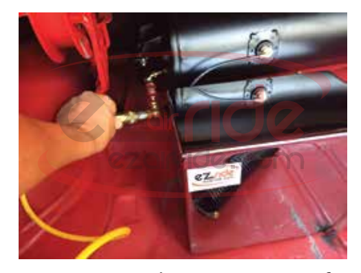
Now use your shop's compressor for your tank's first fill, leaving your Viair compressors to just maintain tank pressure. They will love you for this... if they had a heart;)