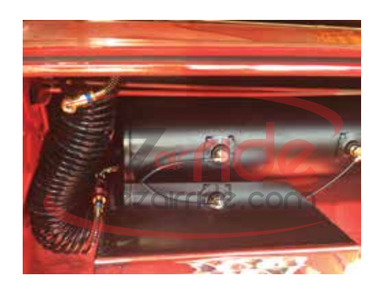
When finished replace the schrader valve with the supplied coil hose and air chuck. You now have onboard air!