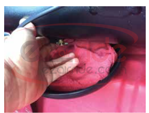
MAINTAINING YOUR TANK?

Depending on your climate, how much you use you air ride system, and the overall humidity will determine how often you should drain your tank. Simply, use a frisbee and the complimentary shop towel to catch any water or debris. With that being said, you may want to start off by draining it once per month. Slowly open the drain cock, catch any moisture with your new shop towel, then tighten your drain cock. Your new Spare Air™ kit will make filling your tank back up a breeze!