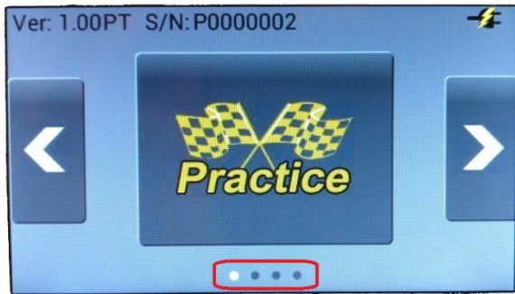
Figure 2 - Eliminator Next Gen Menu

Each multi-page menu in the Eliminator Next Gen is denoted by dots at the bottom of the screen. The number of dots indicates the number of pages in the menu. The “white” dot indicates which page of the menu is currently displayed. To change pages, swipe your finger across the screen from left to right or right to left. See Figure 2.