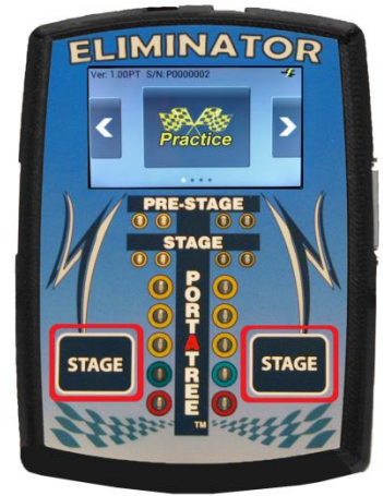
Figure 1 - Eliminator Next Gen STAGE Buttons