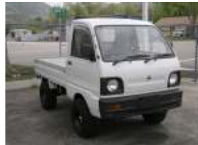
'Utility Type Vehicle'