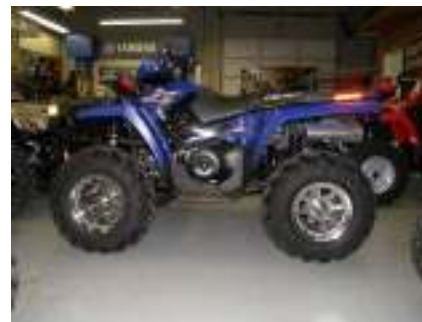
All-terrain Type I Vehicle

Note: Golf carts, go-carts, vehicles not designed for and capable of travel over unimproved terrain, motorcycles and snowmobiles are not allowed to be inspected and registered as a street-legal ATV.