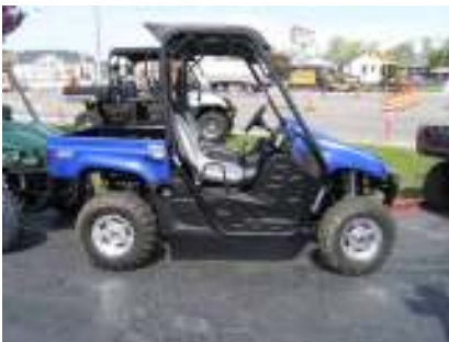
'Utility Type Vehicle'