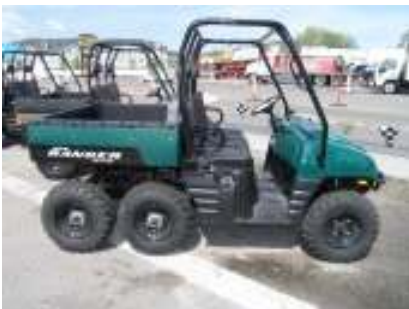
'Utility Type Vehicle'